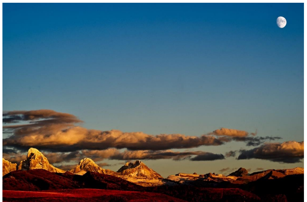
Moon rising over the Grand Tetons in Idaho