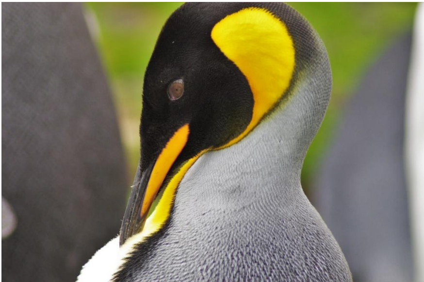
A King penguin I shot in the Falkland Islands