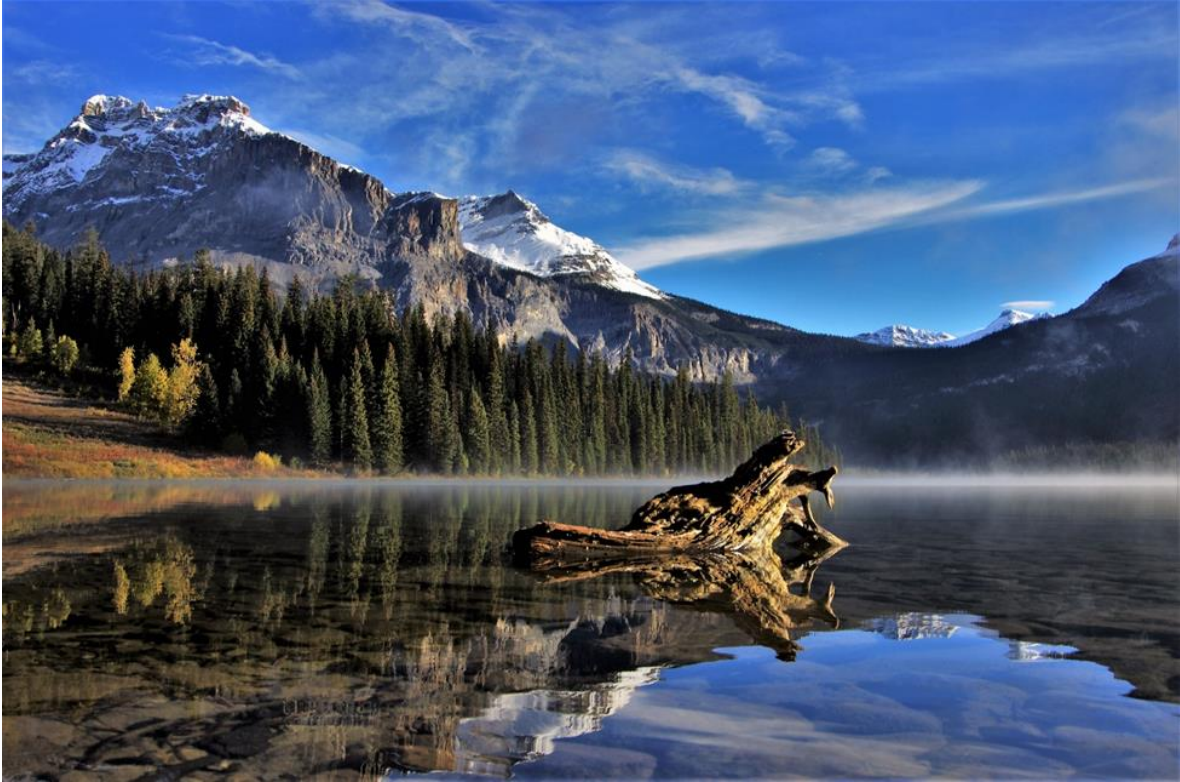
Emerald Lake in Yoho National Park in British Columbia

photographers is a great way to educate myself. The internet is also a great resource. I am a firm believer to shoot, shoot and when you are tired, shoot again and find your own style.