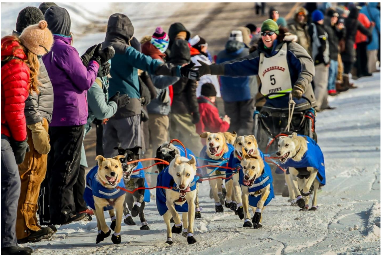
Beargrease Dogsled Start

Photojournalism Honorable Mention Amber Nichols