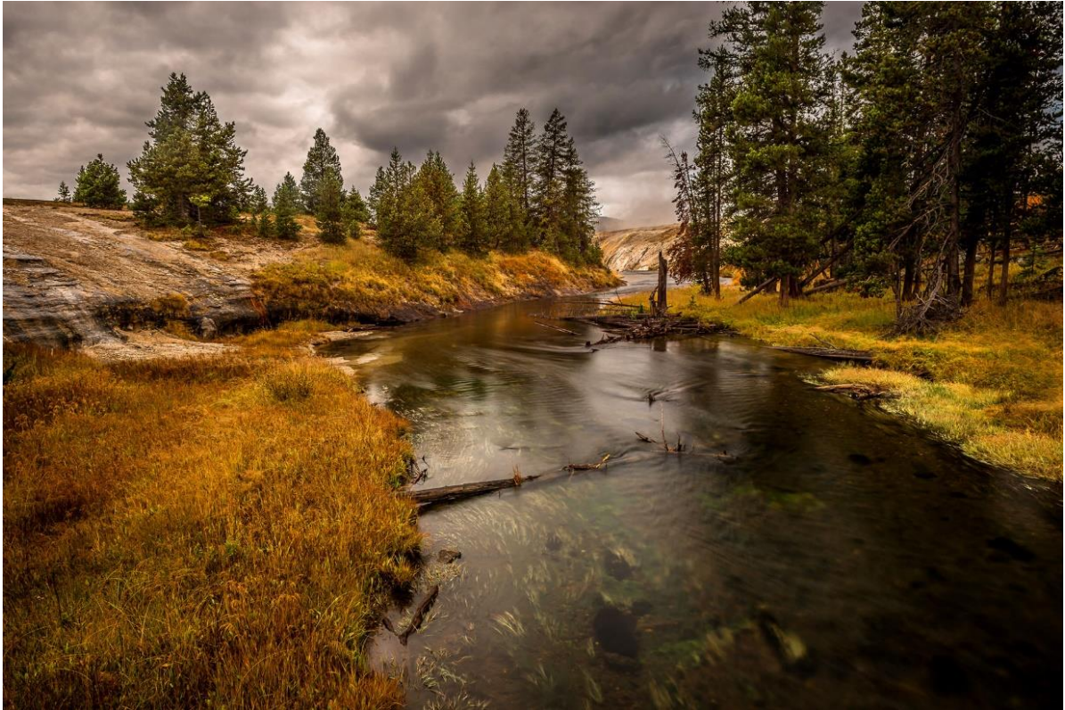
View from a Bridge