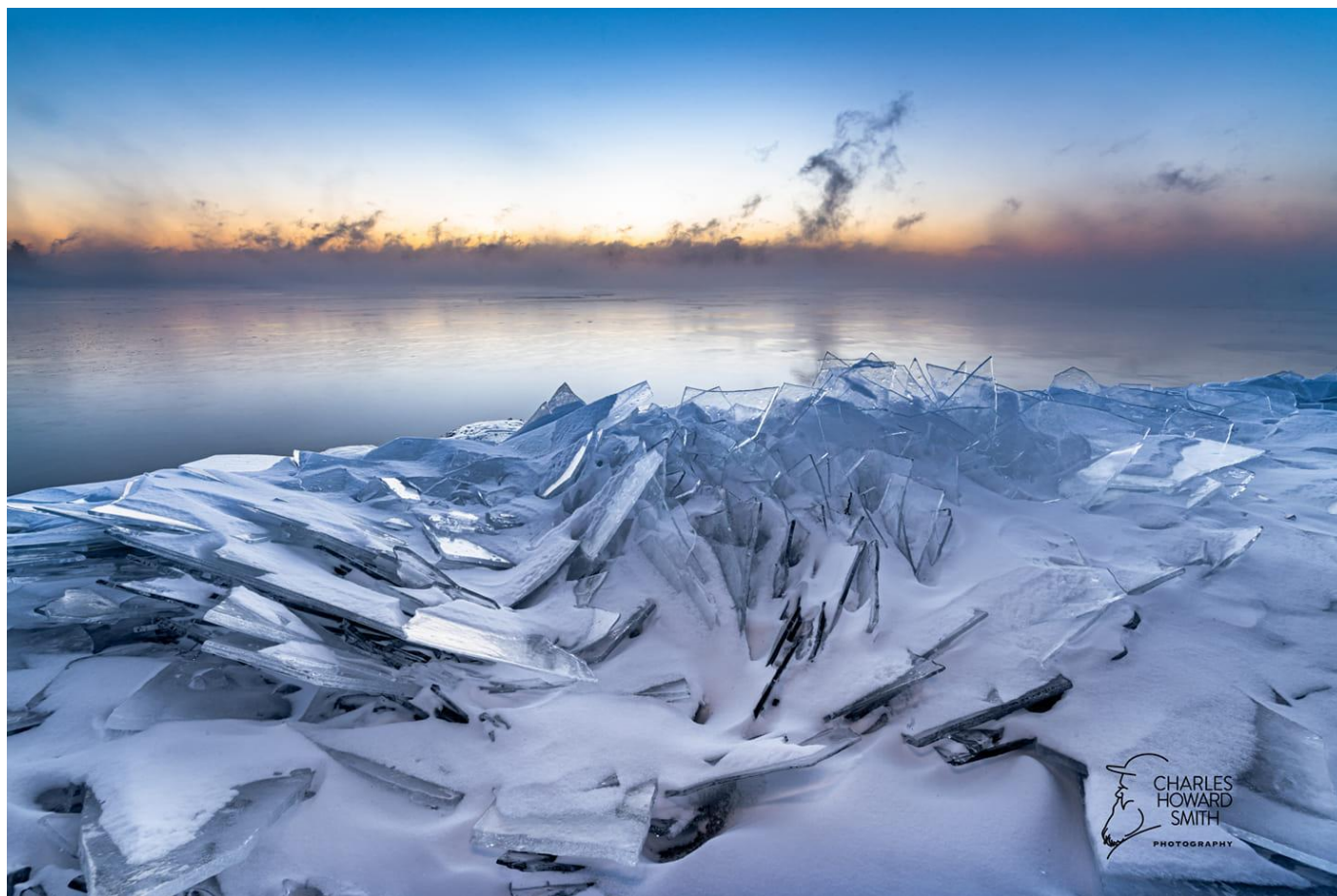
Deep Freeze Beauty