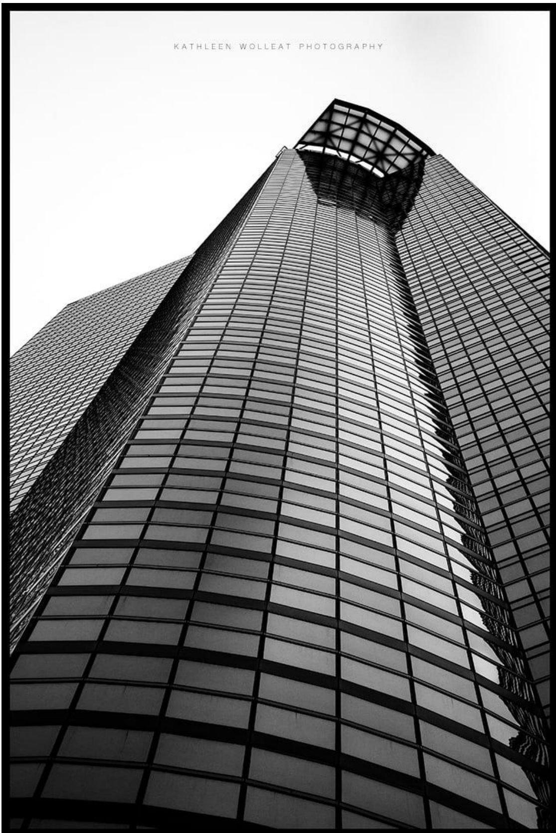
Capella Tower Kathleen Wolleat